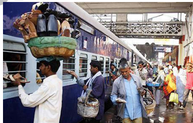
A SCENE AT RAILWAY STATION

Last Sunday I went to receive my uncle. I reached the Station. I bought a platform ticket. I reached the platform. There was great crowd at the Station. There were many Stalls and Vendors. They were Selling Sweets, Namkin, fruits, news paper, magazine and other things. Some passengers were sitting on benches. Some Persons were walking here and there. The train came. I saw my uncle. I received my uncle. We came out of the Station.