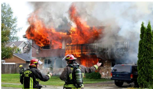
A House on Fire

Last Sunday I was going to market. I saw a house which was on fire. I reached there. Many people were there. Flames were rising high. Smoke was there. Everyone was active. Some people were crying and some were running here and there some people were bringing water. They were throwing water on the fire. Then fire brigade came and controlled the fire in two hours. We thanked God that no one lost his or her life.